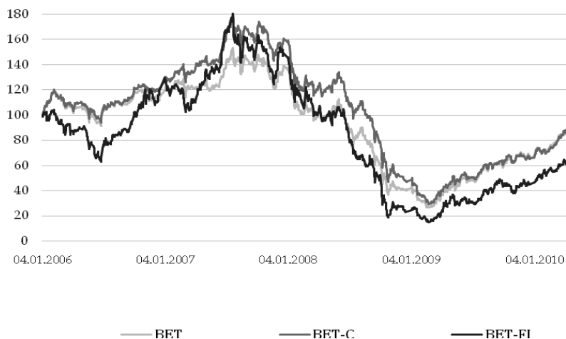
Evolution of those three BSE indices (2006-2010)

Indicele ROTX* (ROMANIAN TRADED INDEX) was launched in March 2005 and reflects the real time evolution of “blue chip” shares. This index is designed as a tradable index and could be an underlying asset for derivatives and structured products.